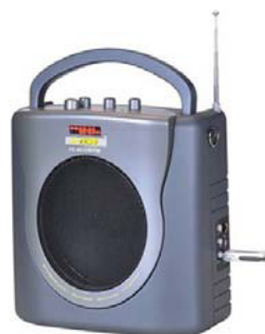
Portable 35W Public Address With wireless microphone Built in FM radio and USB music player.